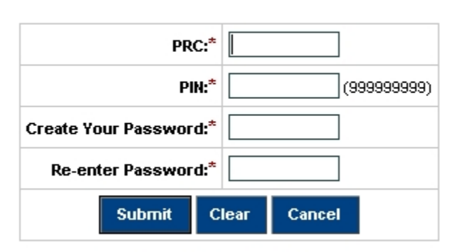
* Field is required